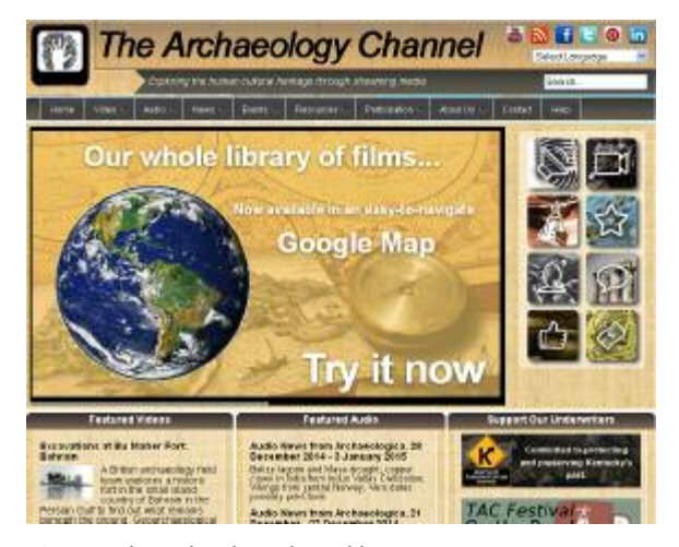
Figure 1. The Archaeology Channel homepage.

The productivity and effectiveness of our work is a direct function of the financial resources applied to it. The enterprise depends on office and studio space, paid staff, equipment, publicity and promotion, recruitment of sponsors, and programming production and solicitation. If we had the funds, we could buy cable TV time and begin to build an endowment for long-term stability. As it is, we find other, slower, ways to grow, such as by finding partners to expand our nationwide station network and convincing cable networks to give us space in their local on-demand menus. We work to expand our audience along with sponsor support.