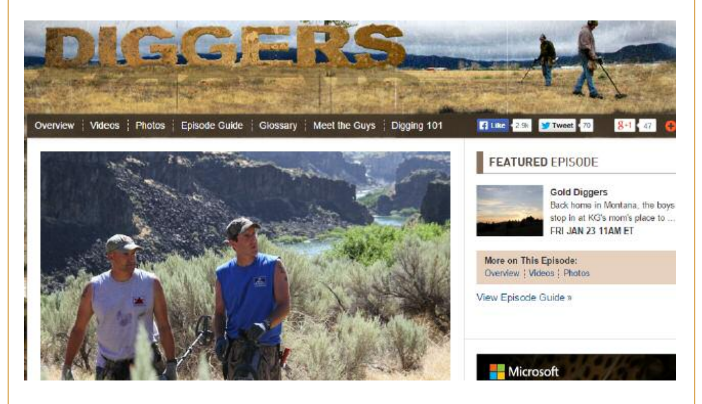
Figure 1. Viewers either like or dislike National Geographic Channel's Diggers. A read through the "Digging 101" tab shows ongoing efforts by the NGC and archaeologists to work together.

logical Sites on Reality TV. The SAA Board directed the Task Force to