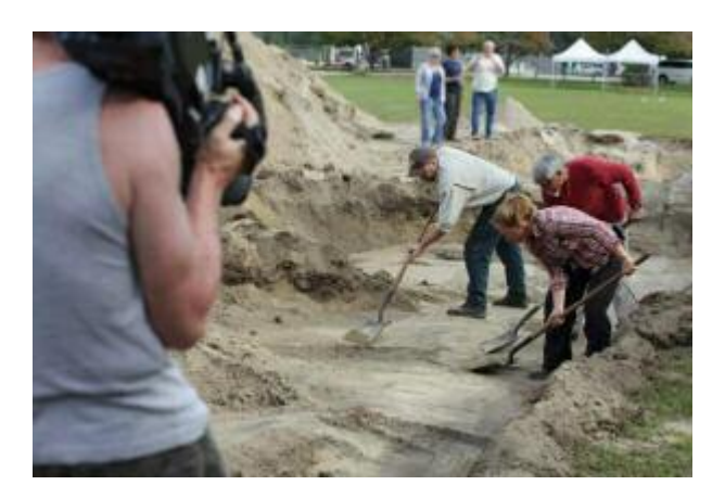
Figure 1. Filming excavations searching for stockade at The Lost Civil War Prison Camp Lawton.

Without funding, we do not have a program. Again, this is where the delicate balance and communication between the television production and archaeological communities is so important. The first season of Time Team America was funded through PBS and Channel 4 International (UK based program distributor and home of Time Team , UK). Unfortunately, PBS did not feel the results of the first broadcast season were sufficient to make Time Team America a priority for continued financial support.