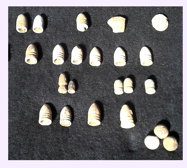
Bullets found by Pat D'arinzo