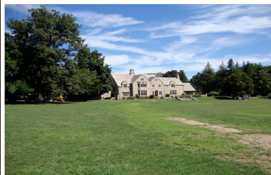
Manor House and "great lawn" at Cranberry Park, Norwalk, CT

We couldn't have asked for a more beautiful day for the club's hunt at Cranberry Park in Norwalk. The park is 219 acres which includes a manor house, garage, barn, tea-house and caretaker's cottage. There are walking trails, open fields and the "great lawn", which seemed to be the most popular hunting spot of the day.