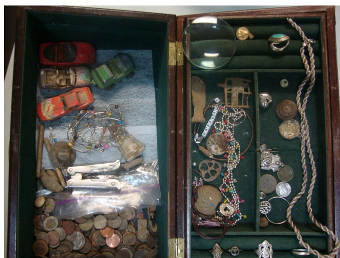
Chest full of finds Found by Camille Lahr