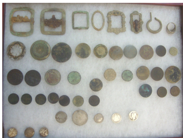
Some great finds by Russ Bergensen, including a 1718 Reale, 1776 Reale, 1776 1/2 Reale, 1843 Seated Dime, 1829 Large Cent, Colonial buttons, buckles & musket Balls