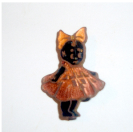
Pin found by Allyson Cohen