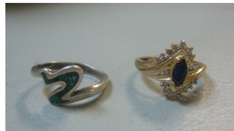
Silver Ring and 10k Sapphire ring found by Pat Russo