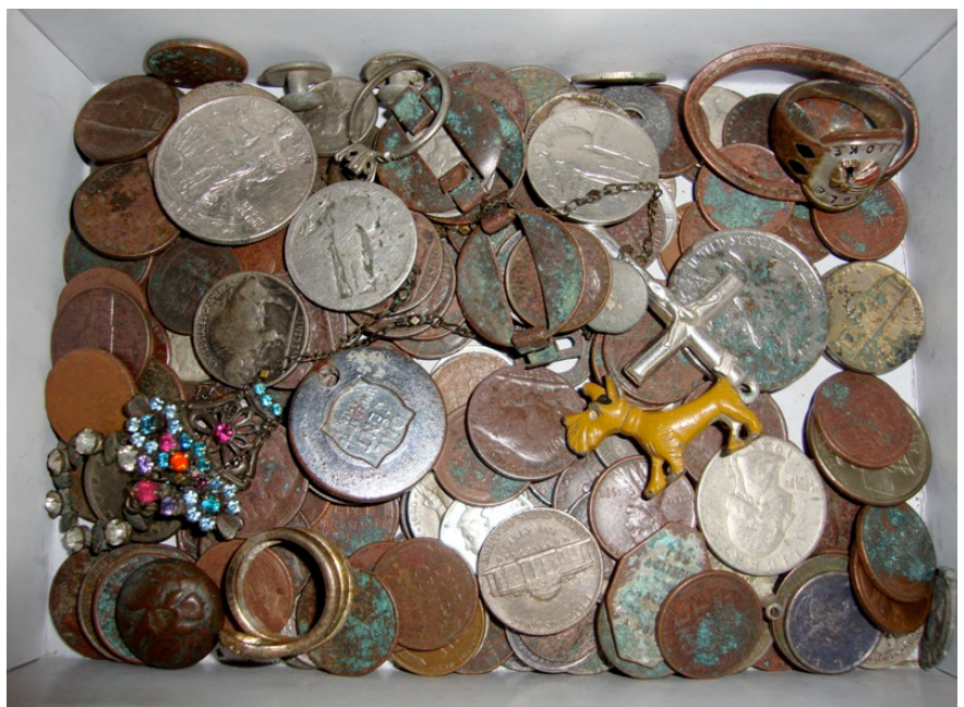
Box o' Stuff found by Dan Godleski