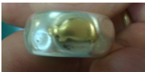
Ring found by Dick Spezzano