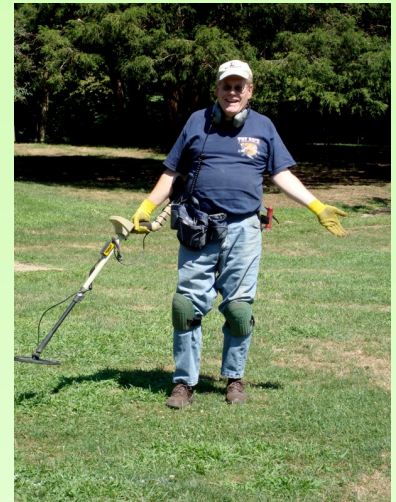
Where's the loot?!