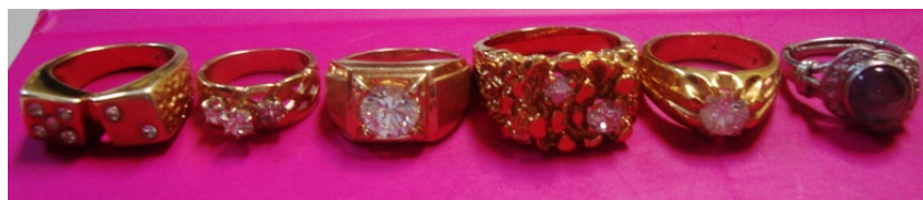
How about another view