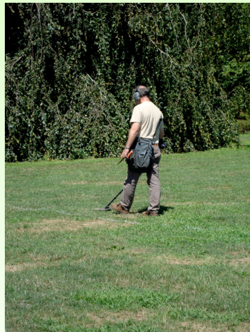
Um...not sure who this is, ...but he's with us