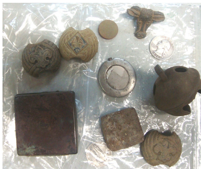
Croatal bell, stamp holder, 1930 Standing Liberty quarter, cosmetic case, 1956 quarter and Boy Scout items found by Pat D'arinzo