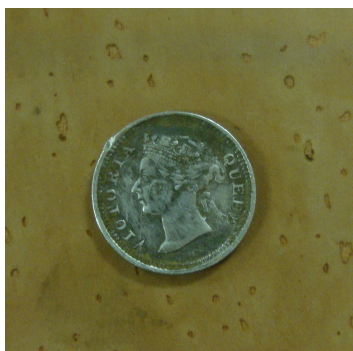
1900 Coin from Hong Kong found by Pat D'arinzo