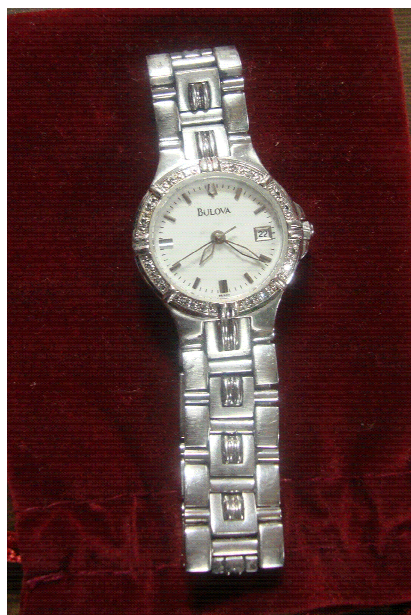
Watch found by Pat Russo at the picnic at Weed Beach

Don't be shy people We want to know what your finding out there Send in a picture ~It's free!~