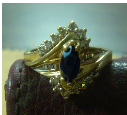
Ring found by Pat Russo

Don't be shy people We want to know what your finding out there Send in a picture ~It's free!~