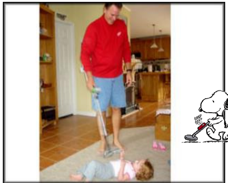
Grandparents use metal detector to find penny in child and later a diaper

They hovered a metal detector over the child's abdomen and sure enough, it would beep. Then after each dirty diaper they would use the detector to see if the diaper would beep. Finally, they had a winner , a beeping diaper! They saved it for mom to check when she returned to pick up her daughter and sure enough, there it was. The child is fine.