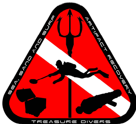
Nor'easters Treasure Diving and Beach Hunting logo