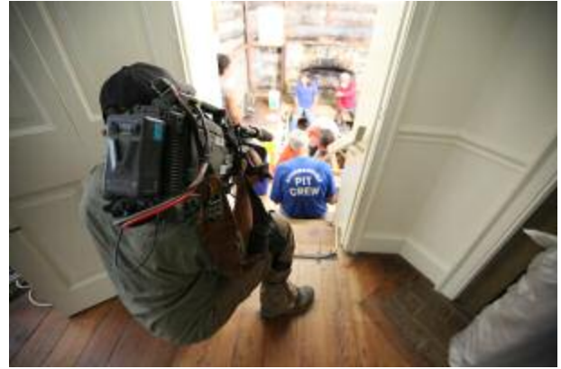
Figure 4. Time Team America camera man filming excavations in the old kitchen, episode "In Search of Josiah Henson."