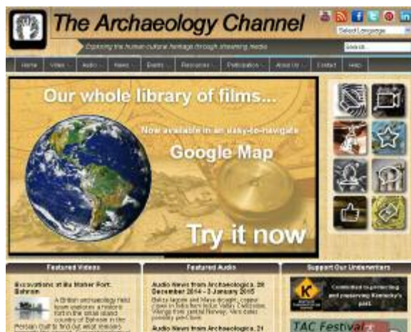
Figure 1. The Archaeology Channel homepage.

The productivity and effectiveness of our work is a direct function of the financial resources applied to it. The enterprise depends on office and studio space, paid staff, equipment, publicity and promotion, recruitment of sponsors, and programming production and solicitation. If we had the funds, we could buy cable TV time and begin to build an endowment for long-term stability. As it is, we find other, slower, ways to grow, such as by finding partners to expand our nationwide station network and convincing cable networks to give us space in their local on-demand menus. We work to expand our audience along with sponsor support.