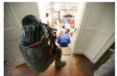
On the cover: Time Team America camera-man filming excavations for the episode “The Search for Josiah Henson.”

Acknowledgments. The 2012 Pimu Catalina Island Archaeology Field School was also supported by the Institute for Field Research (IFR).