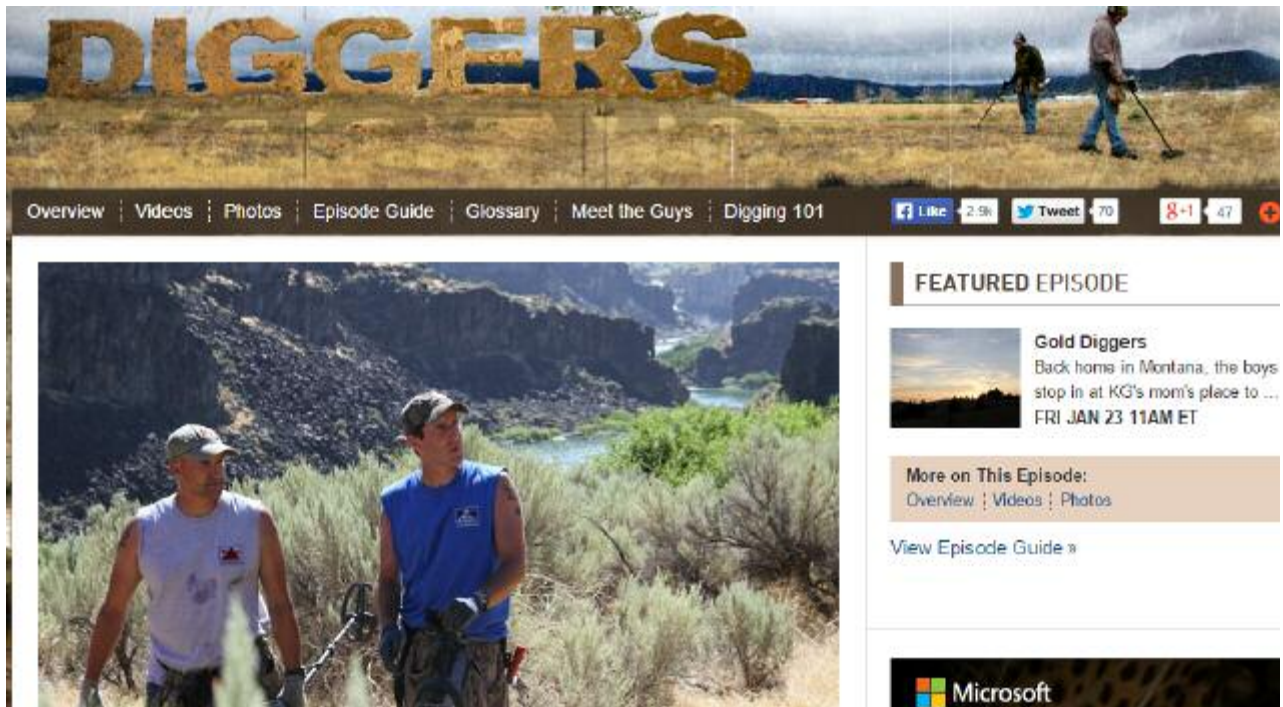
Figure 1. Viewers either like or dislike National Geographic Channel's Diggers. A read through the "Digging 101" tab shows ongoing efforts by the NGC and archaeologists to work together.

logical Sites on Reality TV. The SAA Board directed the Task Force to