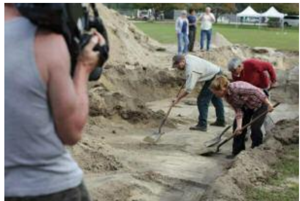
Figure 1. Filming excavations searching for stockade at The Lost Civil War Prison Camp Lawton.

Without funding, we do not have a program. Again, this is where the delicate balance and communication between the television production and archaeological communities is so important. The first season of Time Team America was funded through PBS and Channel 4 International (UK based program distributor and home of Time Team , UK). Unfortunately, PBS did not feel the results of the first broadcast season were sufficient to make Time Team America a priority for continued financial support.